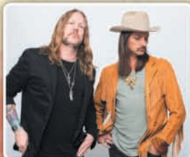
THE ALLMAN BETTS BAND