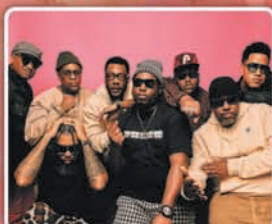
THE SOUL REBELS