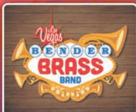
BENDER BRASS BAND