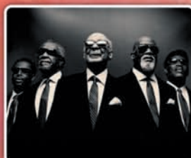
BLIND BOYS OF ALABAMA