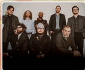
ST. PAUL & THE BROKEN BONES