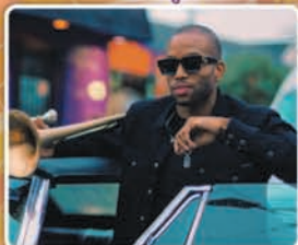
TROMBONE SHORTY & ORLEANS AVENUE